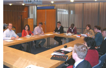
THE 2 ND CIBSC MEETING (APRIL, 2006)

Since our proposal for hosting a CIBSC in our Faculty has been approved by CIB, we have been in contact with other European CIBSC; so that together we could develop a joint proposal for a Young Researchers Network (YRN), that would promote CIB and its objectives, enable the cooperation and exchange of knowledge between CIBSCs, as well as attract other Faculties to create their own CIBSCs.