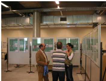
THE PHD POSTER EXHIBITION (APRIL 2006)

Location: Vertigo building, all floors Event: Alumnidag (Old student's Day) Period: April 21 st – May 5 th