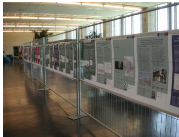
THE PHD POSTER EXHIBITION (JULY 2006)

Location: Vertigo building, Plaza Event: Adaptables 2006, DDSS 2006 and DCC' 06 Period: July 3rd – 14 th