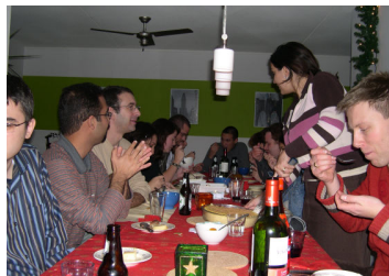
CHRISTMAS DINNER, EINDHOVEN (DEC, 2006)

Last but not least, we organized a Multicultural Christmas Dinner where all our colleagues from Asia, North- and South-America, Africa, Australia and Europe got the opportunity to jointly create a multi-course dinner, to demonstrate their culinary specialties, taste the specialties of others and from other countries and sing Christmas songs together.