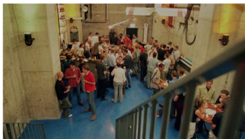
SKYBAR MEETING, TU/E (OKT, 2006)

All PhD-students deliver huge efforts to reach their goals: to write a thesis. Always short of time, always busy, always working with your brains! The most important goal of the 'social activities' workgroup is to find an optimal balance between efforts and relaxation. The following example can make this clear: lift a chair. After a while, you're not able to hold it any more. Your muscles are tired... However, if you put down the chair regularly, you can keep up for a long time! This will be the same regarding your brains. From time to time you must grant them some rest, and then they will keep up for a very long time!